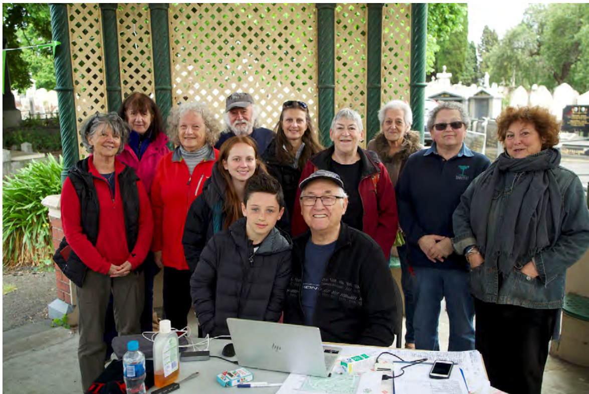
At Carlton General Cemetery November Mitzvah Day 2019