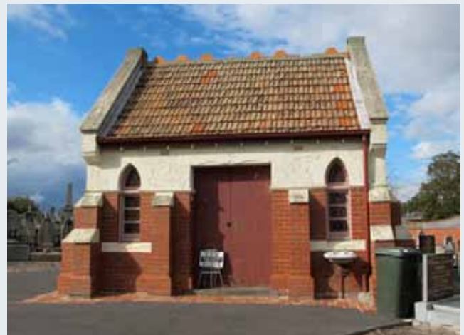
Top: The Lodge, circa 1892. Above: The Metahar House, opened in April 1910.

Jewish burials started in earnest at the Brighton cemetery about 1900 when the Jewish section of the St Kilda Cemetery became full and Brighton became geographically important for those living in the southern suburbs.