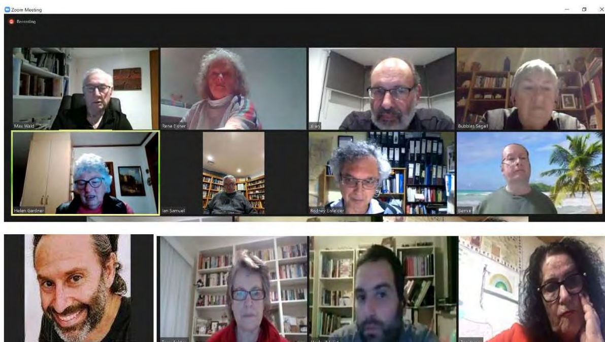
AJGS VIC - COMMITTEE 2020 - 2021