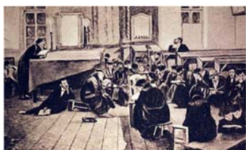
Praying in a synagogue on Tisha B'Av